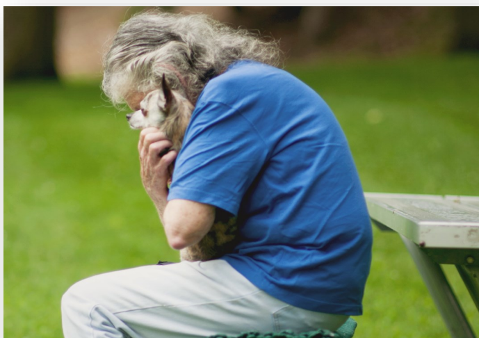
My abusers & captors went to prison for four and six years.

The elder who escaped kidnapping, food deprivation, financial exploitation, psychological intimidation and severe physical abuse in 2014 saw legal and financial recovery through the justice system, healing and trauma support through social and health services, and an animal rescue and shelter from the humane society. Elder Victim Ministry staff and volunteers coordinated services, provided emergency financial assistance and have kept in touch with the victim to avoid re-victimization.